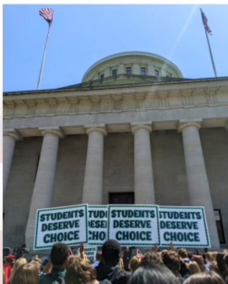
May 17, 2023: Students gathered at the Ohio Statehouse to let our representatives know they support school choice legislation.

These scholarships are paid for by state revenues and do not impact the public school funds generated from local tax revenues , of which every dollar will remain with the local districts. The state's funding, up to the limit of the scholarship amount, will follow the pupil, funding students where they are educated.