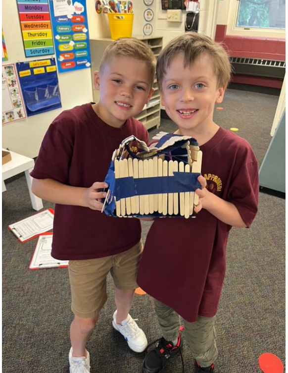
Let's Dig In Camp