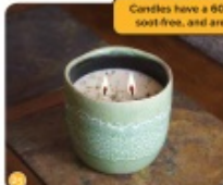
5000-DAFFODIL 1000! $24.00 5000-DAFFODIL 1000! $24.00