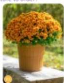
5000-DAFFODIL 1000! $24.00 5000-DAFFODIL 1000! $24.00