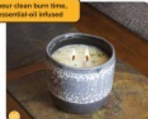
5000-DAFFODIL 1000! $24.00 5000-DAFFODIL 1000! $24.00

Candles have a 60-hour clean burn time, soot-free, and are essential oil infused!