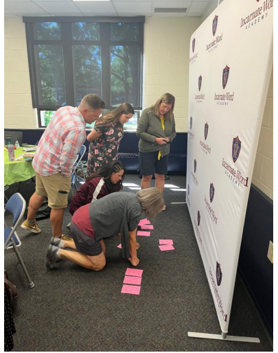
Creating a Statement of Beliefs