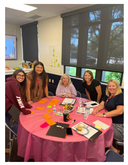
Solving a Team Challenge