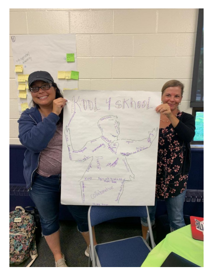
Describing Elements of an Effective Teacher