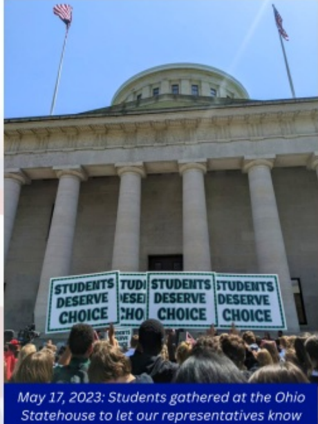
they support school choice legislation.

The Ohio Senate is considering multiple proposals, including making EdChoice scholarships universally available to every student.