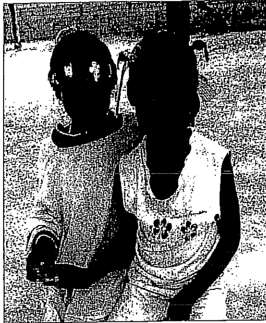
Two Haitian girls pose for a Church of the Assumption mission trip photo.

The Friends of Haiti were planning for a trip which was to have begun Tuesday but has been postponed because